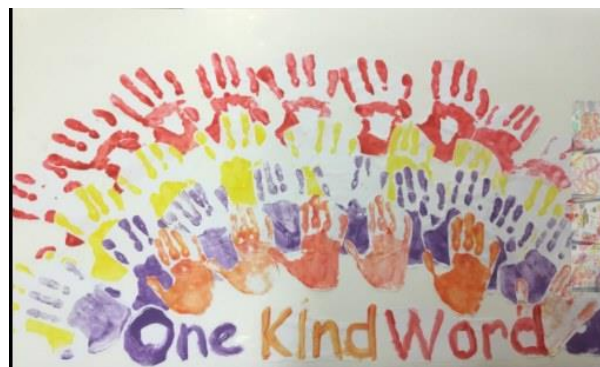
3 - KEY STAGE 3 - By Class 3AT