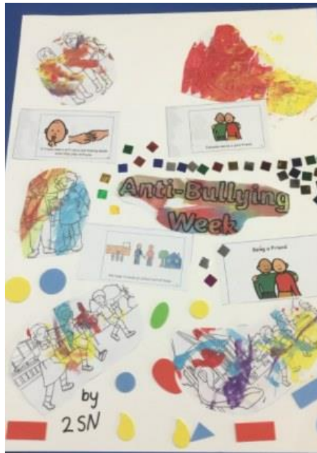
2 - KEY STAGE 2 - By Class 2SN