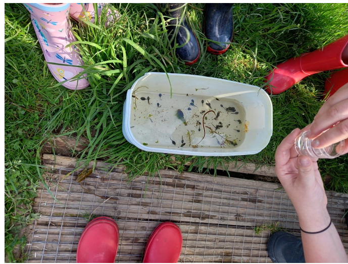
We are planning another session early in August to see if there is any change to the residents of the pond. Details in the August issue of the Newsletter.