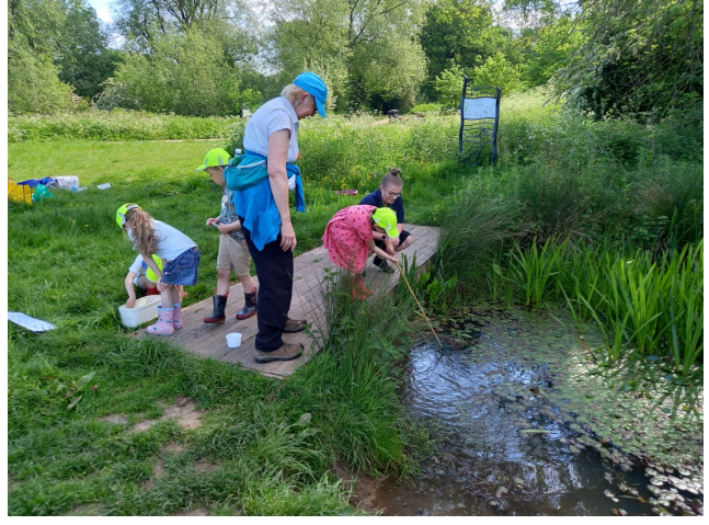
It's lovely down in the Dane Meadow at this time of year! What did they find in the pond?