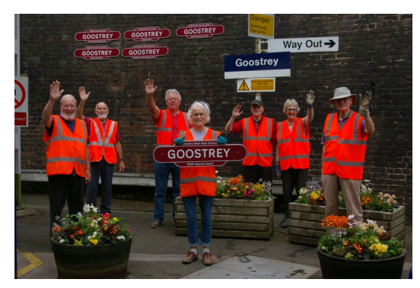
FoGS members celebrate their sixth award from CBKS