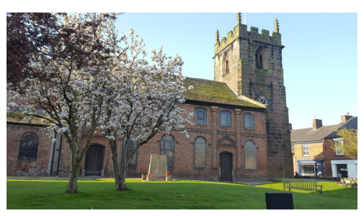
We have news from St Luke's